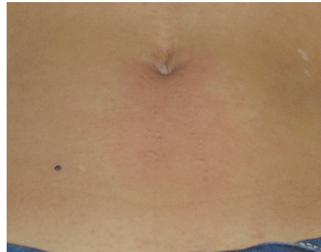
Followup after 6 treatments

LightSheer DUET, High Speed handpiece, 805 nm wavelength Skin type III, Fluence: 8.5-10J/cm 2 , Pulse duration: 30 ms