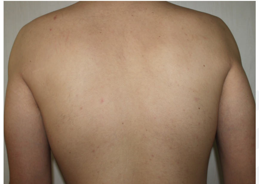
6 months follow up after 5 treatments

LightSheer INFINITY, High Speed handpiece, 1060 nm wavelength Skin type IV, Fluence: 6-7.5 J/cm 2 , Pulse Duration: 30 ms