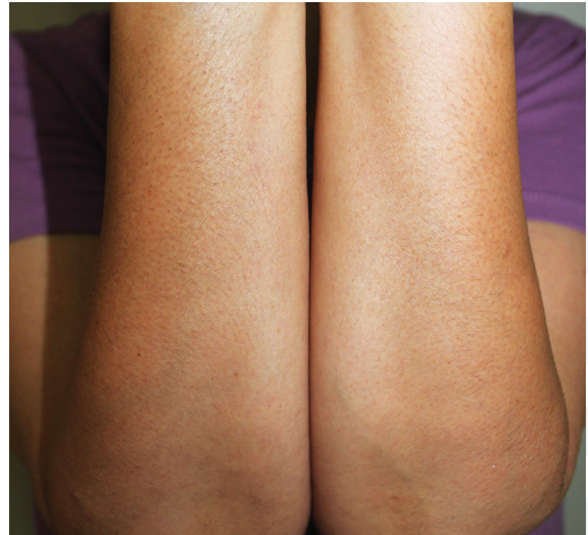
6 months follow up after 5 treatments

LightSheer INFINITY, High Speed handpiece, 1060nm wavelength Skin type V, Fluence: 7.5-12.5 J/cm 2 , Pulse Duration: 30-50 ms