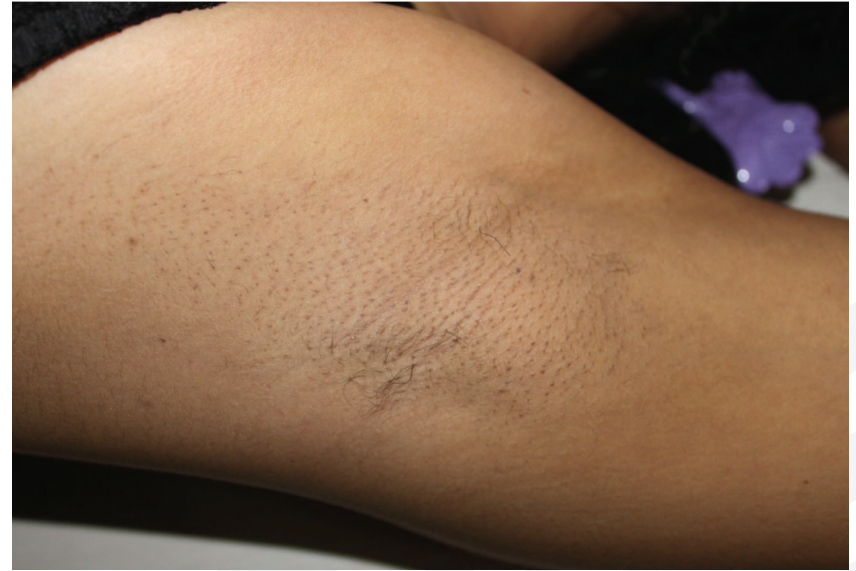
6 months follow up after 5 treatments

LightSheer INFINITY, High Speed handpiece, 1060 nm wavelength Skin type IV, Fluence: 12 J/cm 2 , Pulse Duration: 50-100 ms