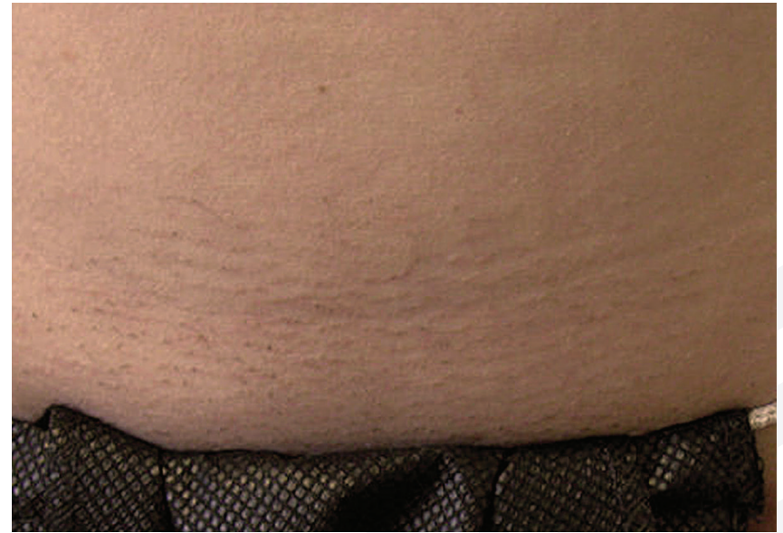
6 months follow up after 5 treatments

LightSheer DUET, High Speed handpiece, 805 nm wavelength