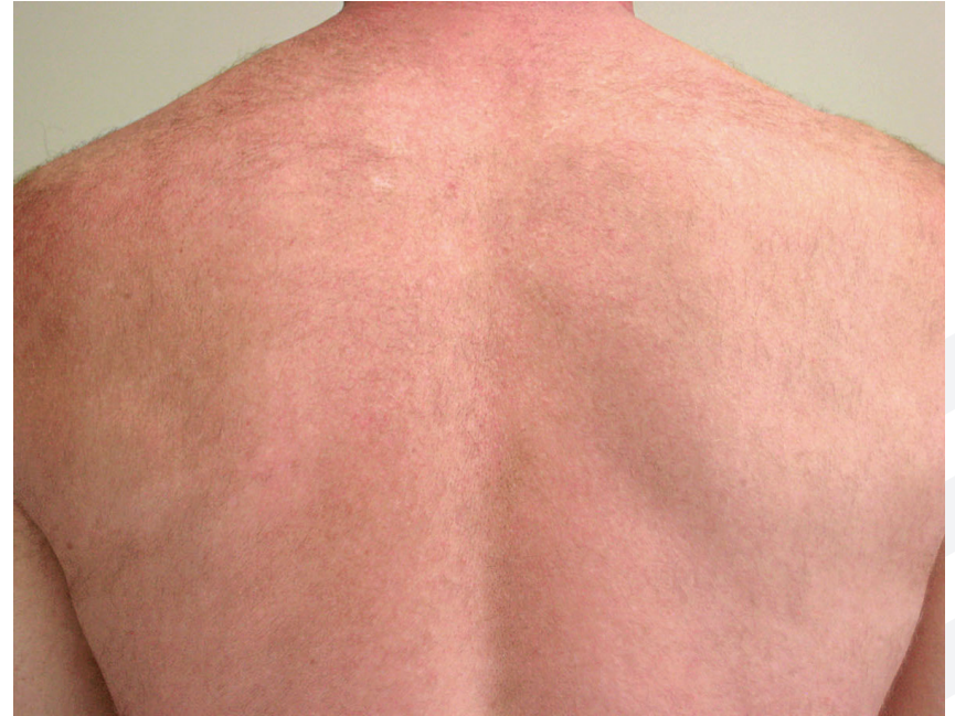
After 2 treatments

LightSheer DUET, High Speed handpiece Fluence: 10J/cm 2 , Pulse duration range: 30-70 ms (Custom mode), 805 nm wavelength