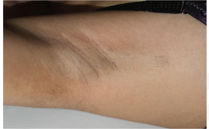
6 months follow up after 5 treatments

LightSheer INFINITY, High Speed handpiece, 1060 nm wavelength Skin type IV, Fluence: 12 J/cm 2 , Pulse Duration: 50-100 ms