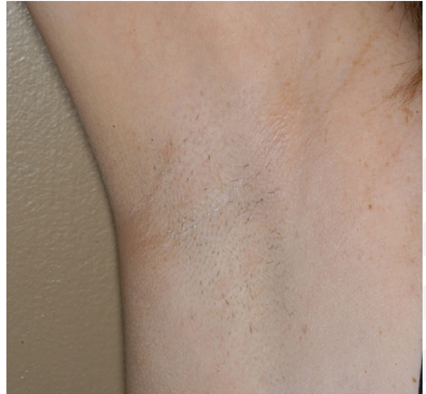
6 months follow up after 3 treatments

LightSheer DUET, High-Speed handpiece Skin type IV, Brown hair , Fluence: 11 J/cm 2 , Pulse duration: 60-66ms, 805 nm wavelength